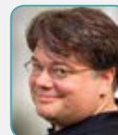
CARL FRANKLIN APP VNEXT