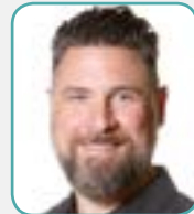
DON JONES PLURALSIGHT