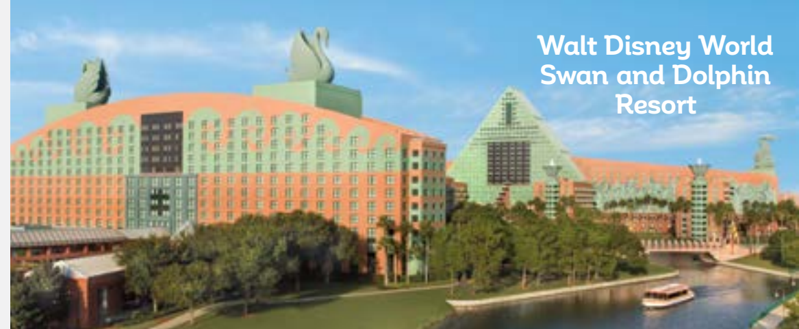
Walt Disney World Swan and Dolphin Resort