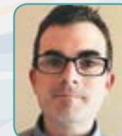
JOE SACK MICROSOFT