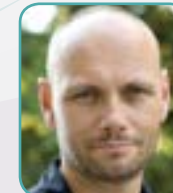
SHEP SHEPPARD DATA SCIENCE 2 GO LLC