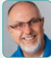
BUCK WOODY MICROSOFT