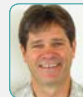
WARD BELL IDEABLADE