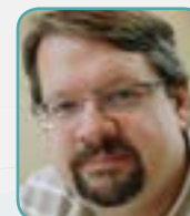
RICHARD CAMPBELL .NET ROCKS!