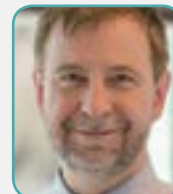
JEFFREY SNOVER MICROSOFT